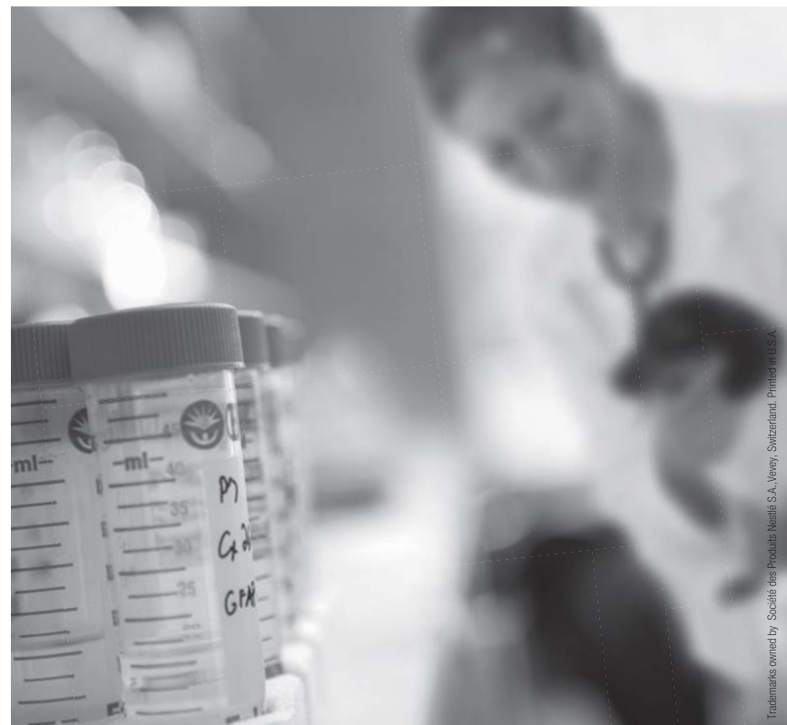
Trademarks owned by Société des Produits Nestlé S.A., Vevey, Switzerland. Printed in U.S.A.